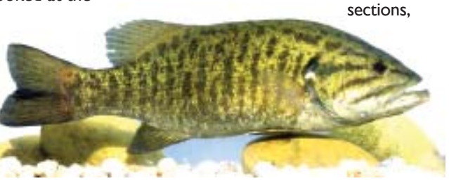
The smallmouth bass Micropterus dolomieu is a voracious predator.

cessible Bain's Kloof. Bass have entered the river from the Breede River and have colonised a 6 km section in the lower reaches, but have been prevented from penetrating further upstream by a waterfall. During a snorkelling survey of five pools and three riffles above and below the waterfall, Jeremy counted 1667 Burchill's redfin and 353 Cape kurper in the upper section, but only 4 redfins and two kurpers, as well as 13 bass, below the waterfall. No marked difference in habitat could be found between the two