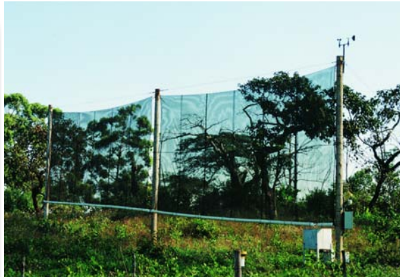
The giant fog screens at Tshanowa Junior Primary School in Limpopo province are providing pupils and members of the community an average of between 150ℓ and 250ℓ of water per day