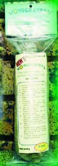
The “WonderStraw” sachet.

A typical example of algal problems in a water feature with koi, which can successfully be removed by WonderStraw.