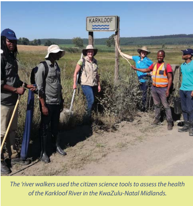
The 'river walkers' used the citizen science tools to assess the health of the Karkloof River in the KwaZulu-Natal Midlands.

over 90 families of macroinvertebrates, miniSASS involves only 13 broad groups, such as worms, crabs, snails, dragonflies, and bugs and beetles. Depending on which groups are found, a total score is calculated for the Present Ecological State of the river site, equating to a health category ranging from 'natural' to 'very poor'. Results can be uploaded to a Google Earth layer via the miniSASS website ( www.minisass.org ) or an Android app, with the health status of sampled sites depicted as different coloured crab icons.