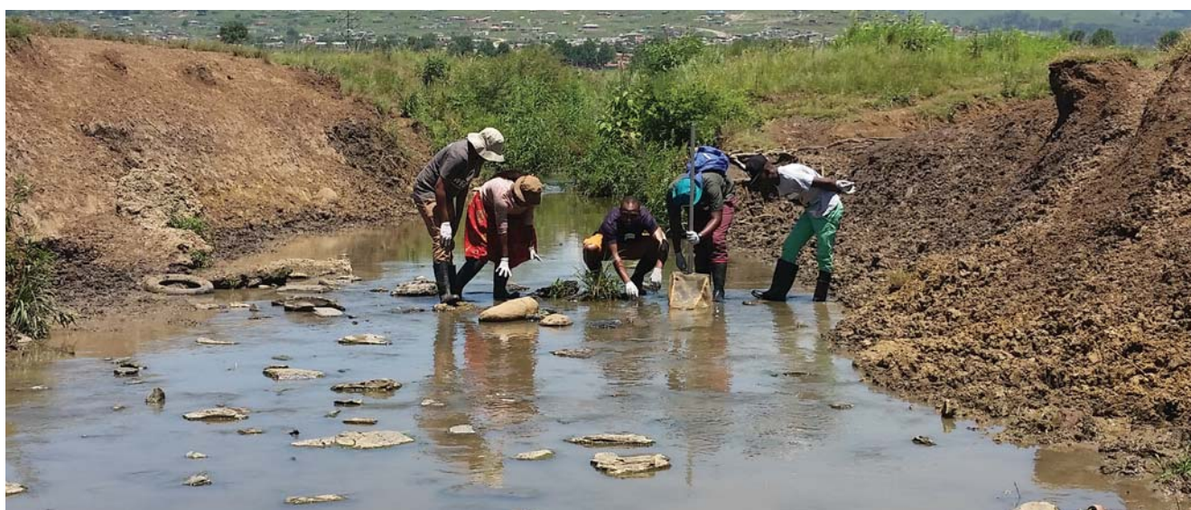
Councillors and traditional leaders use miniSASS during the fieldwork component of the leadership seminars offered by WESSA in partnership with the Department of Cooperative Governance and Traditional Affairs.

Uptake of the tools has been promising, thanks to a concerted effort made by the project team and others to publicise them through seminars, training days and events