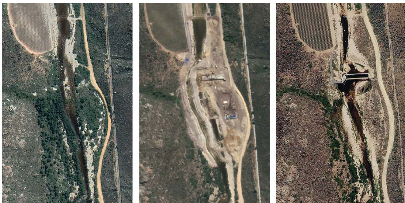
The Holsloot weir site in August 2018 (left), before construction began and with the site infested with alien plants; October 2019 (middle), six months after construction began; and December 2025 (right), after the rehabilitation work had been completed.