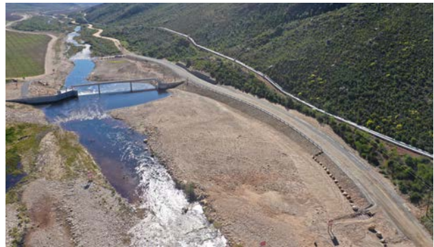
The Holsloot weir in July 2021, two months after the handover ceremony. At far right is the pipeline that conveys water from Stettynskloof Dam to Rawsonville and Worcester.

In short, a 1:40 scale physical model study conducted at the Stellenbosch University Hydraulics Laboratory together with a geotechnical investigation of the site guided the construction of a 55 m long notch weir, which includes a 10 m low-notch section set 180 mm below the rest of the crest. A concrete roller-bucket with a 4.3 m radius extends along the entire structure to dissipate hydraulic energy, and a riprap zone downstream of it protects the riverbed against erosion and undercutting. The intake for the diversion works is protected from sedimentation by a gravel trap and two sand traps, with the head provided by the low notch helping to flush the traps during small floods so that they are self-scouring. The diverted water is piped to a chamber a little over a kilometre away and then distributed by