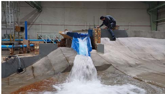
A 1:40 scale physical model of the Stettynskloof Dam spillway was built at Stellenbosch University's Hydraulics Laboratory to evaluate raising options as well as energy dissipation by its ski-jump and plunge pool.