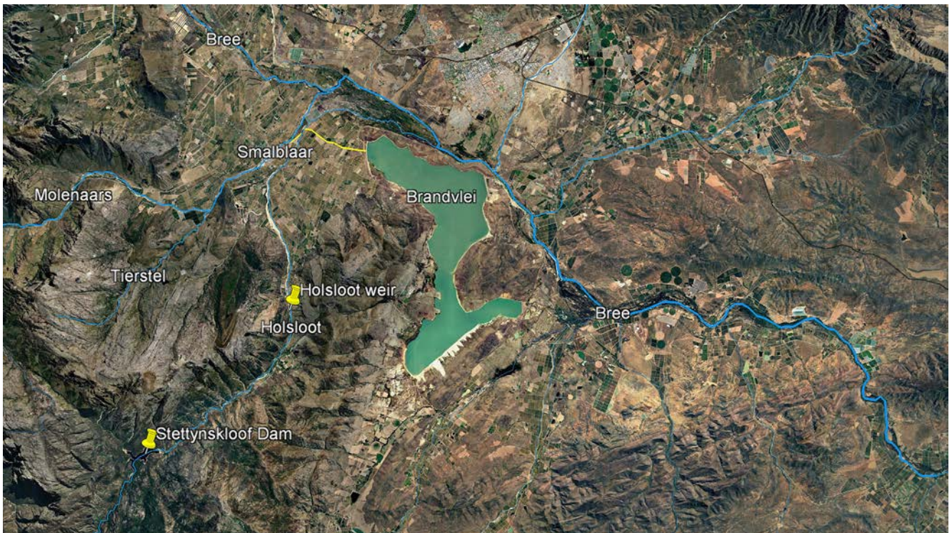
Technical studies and infrastructure investments on the Stettynskloof Dam, Holsloot weir and Brandvlei feeder canal (yellow line) have brought the Holsloot River into sharp focus in recent years.