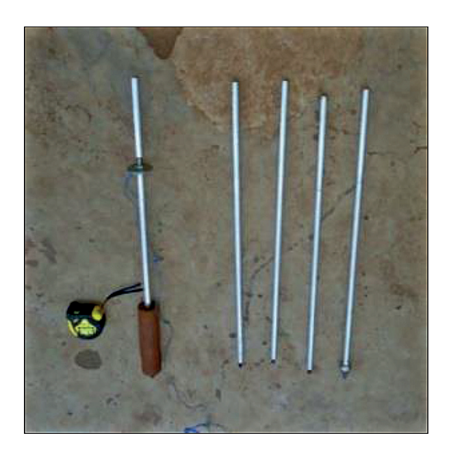
Figure 1 Cone penetrometer components

At each location, the slab depth and depth to excreta were measured. The penetration head with 2 rods connected was lowered into the pit until the rods ceased falling under their own weight (more rods were added if required) and a