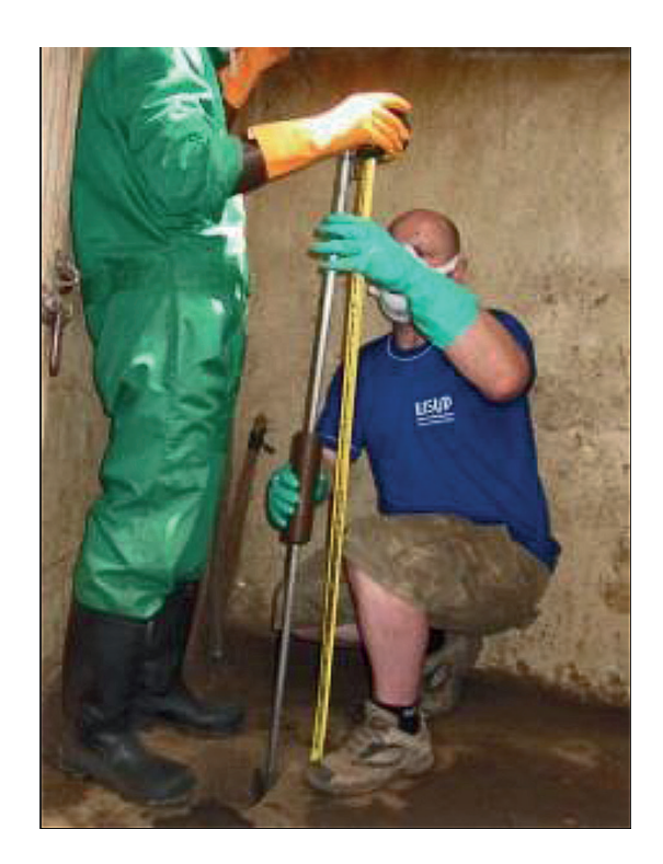
Figure 2 Cone penetrometer in use

The measurement of the depth of the cone with each impact was converted into plots of depth in the pits against penetration per impact by subtracting each measurement from the preceding one. However, from a visual inspection of these plots it is hard to spot any trends; the pits also have a varying number of data points; however pits with a small number of data points are no less significant than those with a large number of data points. The authors were keen to avoid any visual or manual interpretation and instead decided to use Spearman's