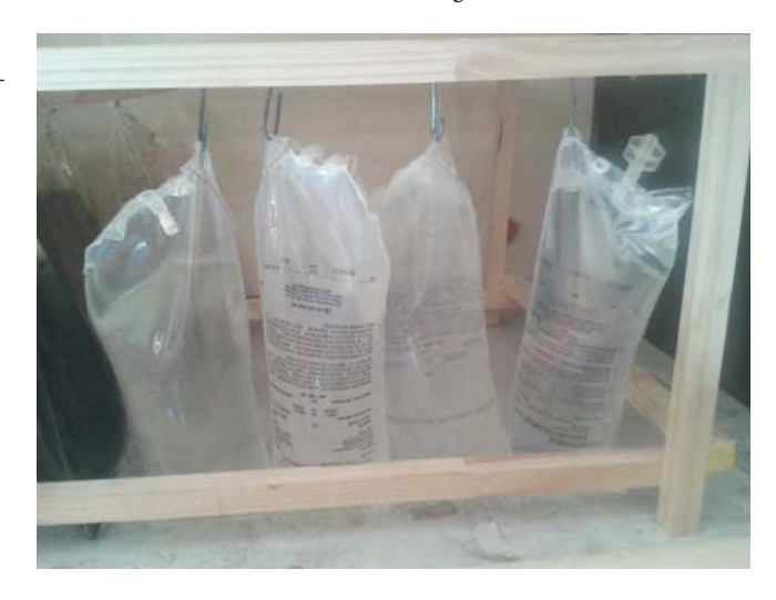
Figure 1 The bioreactors containing different ratios of AMD and SDWWS on Day 0 of incubation

Anaerobic domestic wastewater sludge obtained from the anaerobic digester tank at the Pniel wastewater treatment plant was used as microbial inoculum. Samples were collected in 5 L containers and left overnight at 21°C. Thereafter the bioreactors containing the SDWWS:AMD ratios (Table 2) were inoculated with 10 mL domestic wastewater sludge.