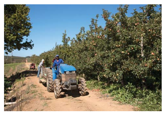
The apple regions emerged as more vulnerable to climate change than wheat. This is because apple orchards operate on considerably longer timescales than annual wheat crops, typically surpassing 25 years.

She used observed climate datasets and production data to understand the impacts of the drought on producers. Theron also investigated actual drought-related adaptations at the farm level and the factors that appear to be driving and supporting these actions. Theron analysed the physical and spatial characteristics of the drought using both agricultural and