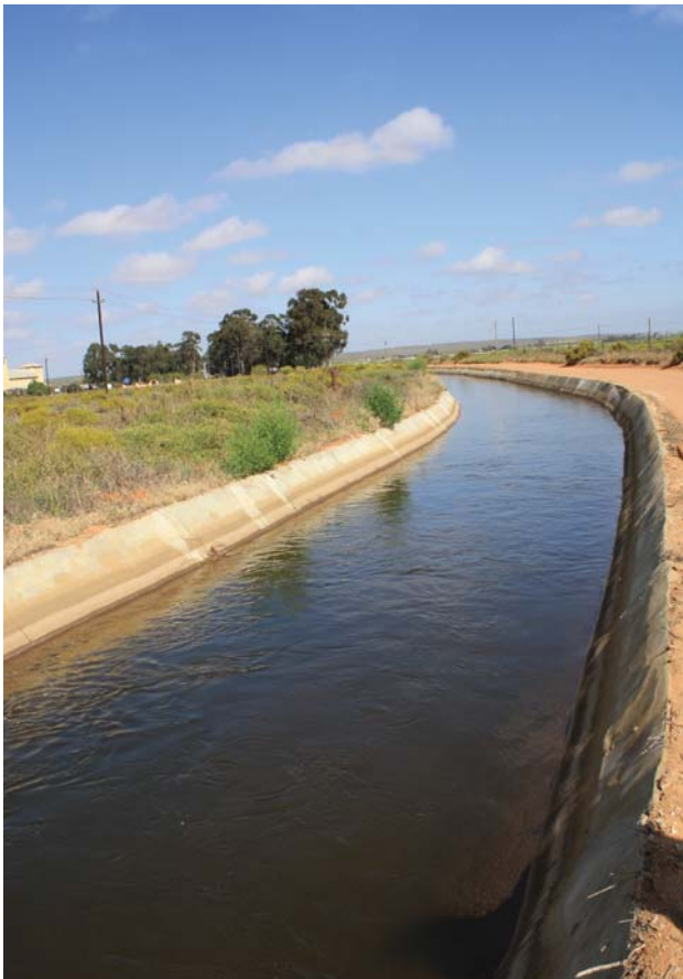
The Lower Olifants irrigation scheme is one of the oldest irrigation schemes in the country where WAS is being implemented.

At a time when innovative science and informed management practices are paramount, given recent droughts and South Africa’s emerging water realities, the WAS is “ideally placed” to support irrigation scheme managers and water users