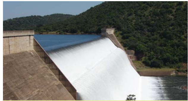
Loskop Dam. The WAS was initially implemented at the Loskop irrigation scheme but is now implemented on 21 schemes across the country.

WAS consists of nine modules that can be used partially or as a whole, depending on the requirements of the particular irrigation scheme and local conditions. This includes modules