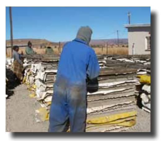
Figure 7: The use of an innovative stacking system makes it possible to cast large numbers of slabs in a relatively small area