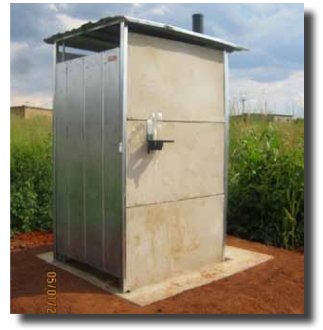
Figure 15: Since 2011 precast superstructures are the norm for the ANDM's sanitation programme. The change was motivated by long term maintenance considerations – it was felt that it would be preferable to build a new substructure and move the superstructure than to empty the pit.