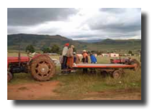
Figure 12: Transport is a major component of a rural sanitation programme. The ANDM have made extensive use of community based transport contractors.