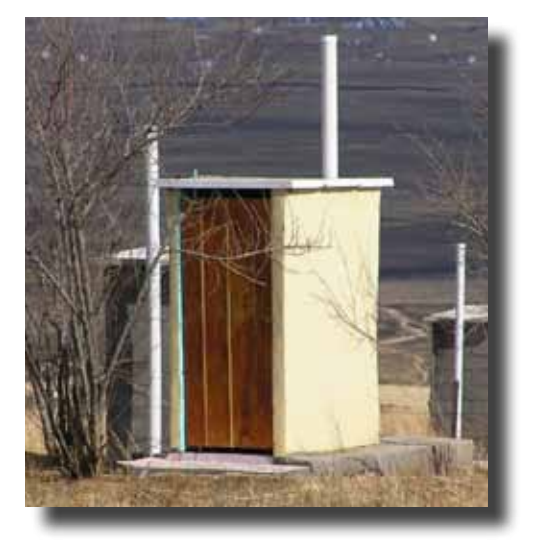
Figure 14: From 2004 to 2010 concrete block VIPs were the standard used in the ANDM sanitation programme. In 2011 the decision was made to switch to precast superstructures