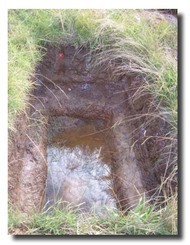
Figure 17: The internal usable volume of a pit should be at least 2 m^3 if a pit is to last a family of six more than seven years before emptying or moving is required. Where the water table is high or where the soil depth is shallow the pit must be raised and extended (Figure 18).