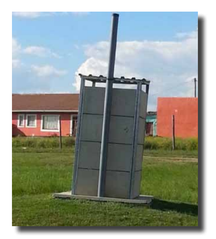
Figure 22: Many of the precast VIPs seen near Mt Ayliff are not vertical. Better specifications and quality standards are needed.