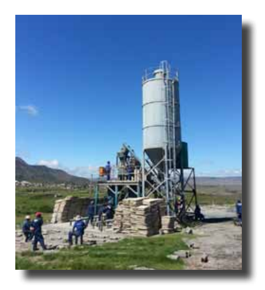
Figure 10: At the Mt Ayliff Zone Site cement is purchased in bulk and stored in the silo. On the left is a pan mixer. This installation has a capacity to produce up to 5 000 blocks per day, which is more than the sanitation programme requires. The spare capacity could be used to supply blocks to the local housing market.