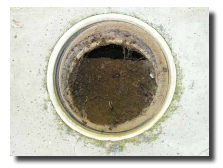
Figure 23: The opening for the vent pipe should be unobstructed. In this case most of the opening sits on top of the wall of the pit lining, thus making it much less effective.