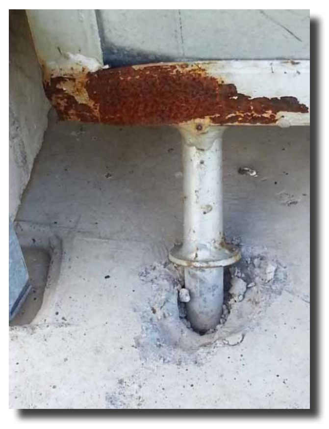
Figure 21: All steel components must be hot dip galvanised or they will not last. Also, attention needs to be given to the alignment and strength of the door swivel pins and the swivel sockets.