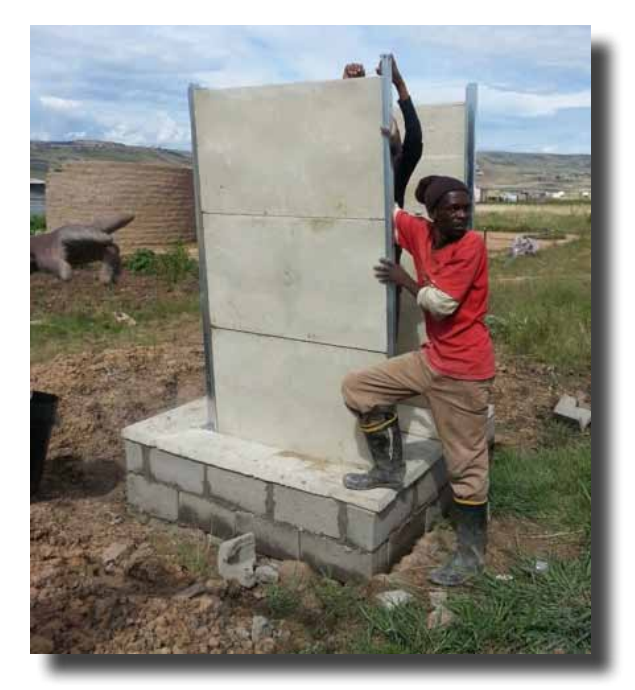
Figure 16: Blocks are still used for the substructures and pits are fully lined for structural stability. Below ground level the vertical joints of the blockwork are left open to enable leaching – this is very important. Failure to do so results in sealed or semi-sealed pits which can be expected to need emptying at least once every year, if not more often.