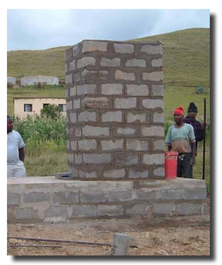
Figure 18: A raised and extended pit is used where there is inadequate soil depth. The usable pit volume should be at least 2 m<sup>3</sup> to give a pit a design life of 7 years or more, but larger is better.