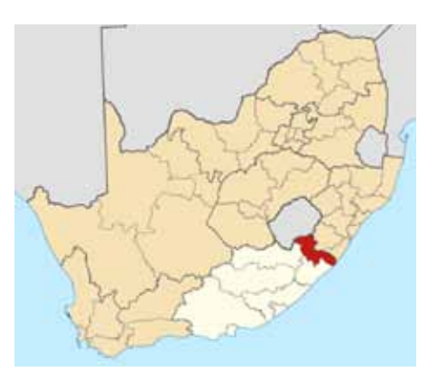
Figure 1: The Alfred Nzo District Municipality shown highlighted on the map of South Africa

The Alfred Nzo District Municipality in the Eastern Cape is bounded by the Drakensberg escarpment and the Lesotho border in the west, the Indian Ocean in the east, the KZN District Municipalities of Sisonke and Ugu in the north and the Eastern Cape District Municipalities of Joe Gqabi (formerly Ukhahlamba) and OR Tambo in the south (Figure 1). When it was first demarcated in 2000 it comprised three local municipalities, namely Matatiele, Umzimvubu and Umzimkhulu. After the 2006 local government elections the latter was re-demarcated into Sisonke, and after the 2011 elections the local municipalities of Bizana and Ntabankulu (previously under the OR Tambo district) were incorporated into the ANDM. The population of the district has over the past decade therefore first decreased and now increased. Its present level is estimated at 801 344 people and 169 261 households.