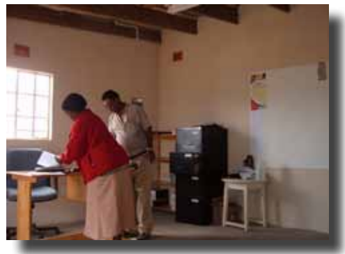
Figure 5: The office of the Maggie Resha MZSC at Maluti - one of nine Municipal Zone Services Centres which were built during Phase 1 of the ANDM Sanitation Programme