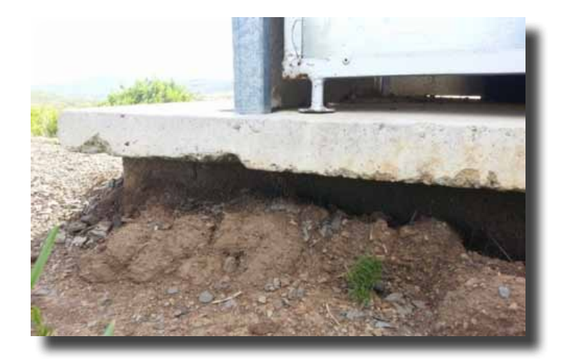
Figure 20: The precast slab in this design (seen in a village near Mt Aylifff) does not fit evenly on the substructure