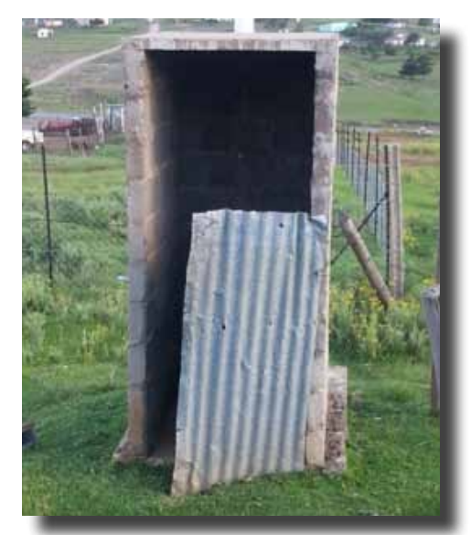
Figure 19: A problem with the ANDM sanitation programme and many similar programmes elsewhere in South Africa is a lack of quality guidelines and/ or quality control. The latrines in the background were built by one of the service providers in the first phase of the programme. The doors proved to be not durable and now need to be replaced.