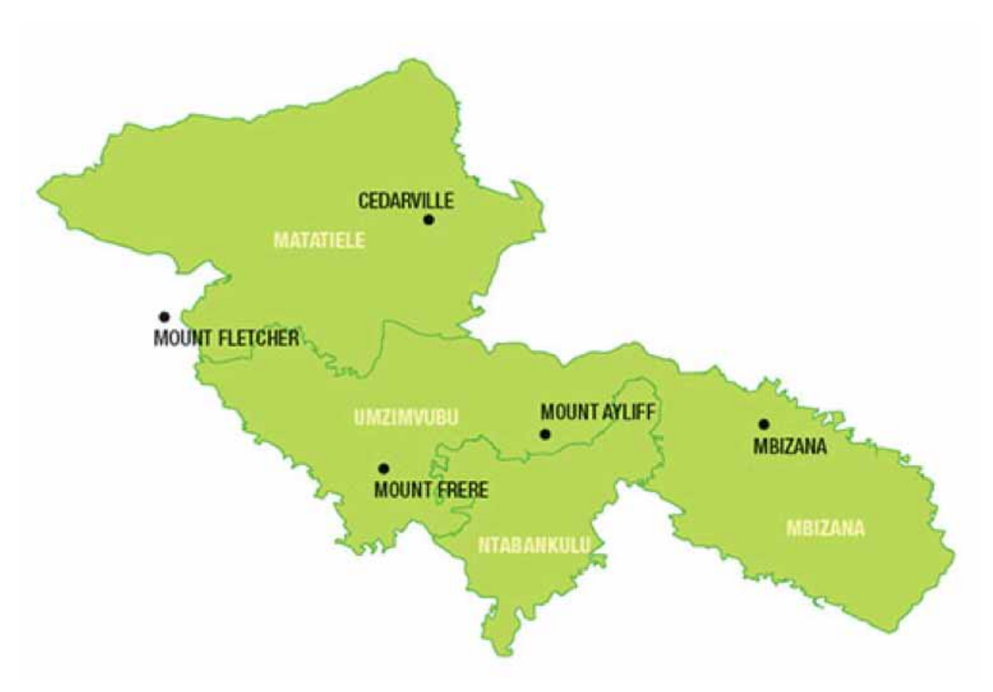
Figure 2: The ANDM is now made up of four local municipalities: Matatiele; Umzimvubu; Ntabankulu; and Mbizana