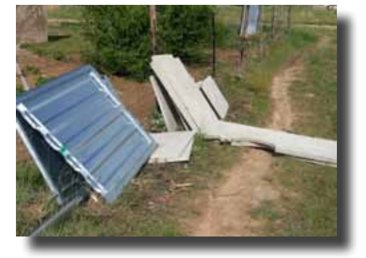
Figure 13: On-site delivery of everything that is required for the superstructure, ready for assembly: two floor slabs, a galvanised steel frame, nine wall panels, the galvanised steel door and the galvanised steel roof (complete with frame).

Midway through Phase 3 the ANDM decided to switch to precast VIPs. The motivation for this decision was to obviate the need for the emptying of full latrines. However, the DM will have to budget in future for the construction of new substructures when VIPs are due to be moved.