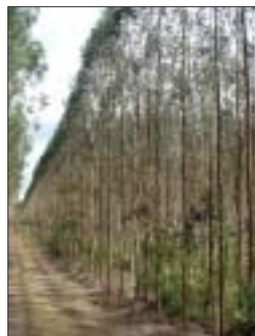
Eucalyptus trees - p 18