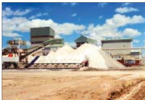
Soda ash plant, Sua Pan, Botswana - p 6