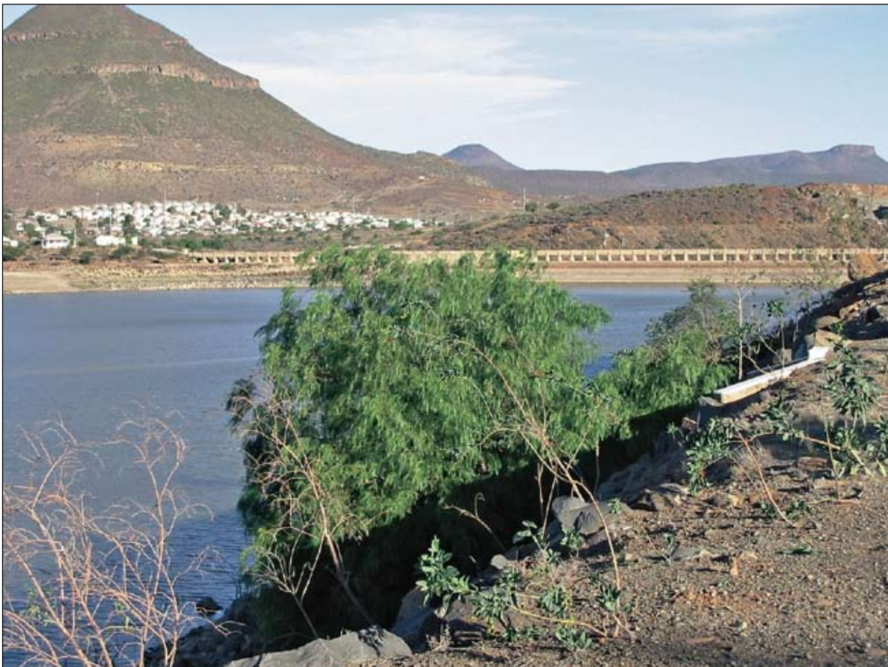
South Africa's Van Ryneveldspas Dam on the Sunday's River at Graaff Reinet has a catchment area of 12,382 km 2 . By 2009 it is estimated that there will be around 49,1 million m 3 of sediment in the reservoir, with a remaining storage capacity of only 29 million m 3 .

Dating the sedimentary layers has relied on ^{137}\text{Cs} , first seen in 1958 and peaking in 1965, on variations in unsupported ^{210}\text{Pb} activities with depth in the sediment column, and on fine gravel layers which can be associated with known storms, for example, four extremely wet days from 1 to 4 March 1974 with 209 mm of