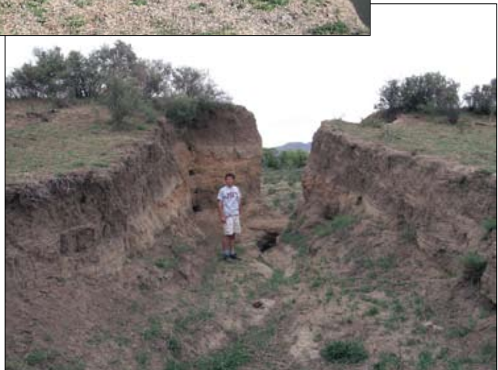
Right: By July 2006, a well established gully was cutting back into the stored reservoir sediments. The gully head has extended around 25 m since 2003.