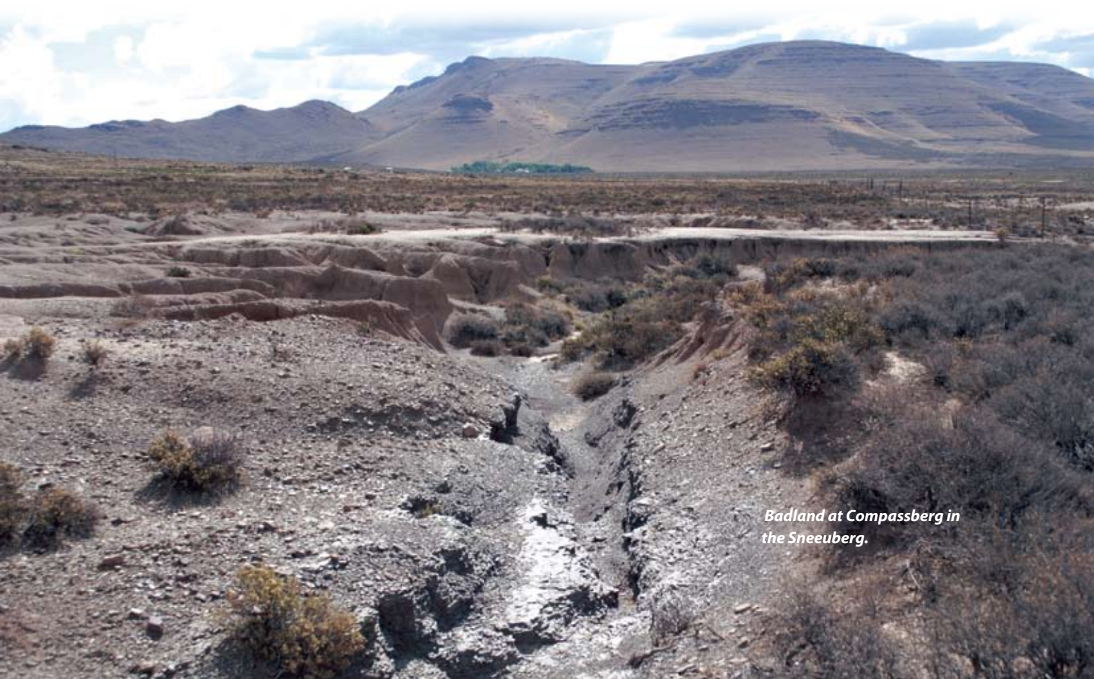
Badland at Compassberg in the Sneeuberg.

Documentary evidence has, in some cases, provided the age of dam construction or re-construction. Estimates of dam trap efficiency have continued to be a challenge, especially at Cranemere where the dam wall has been raised on at least three occasions since it was first built in the 1840s.