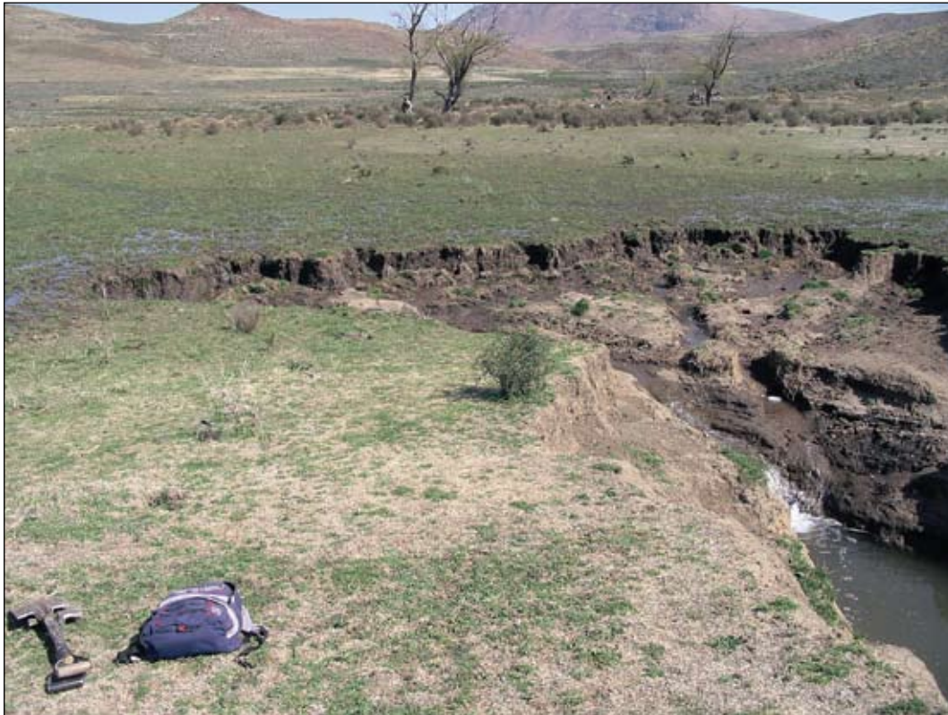
Above: Compassberg Dam breach. Initial breaching occurred in 2000 and this photo, taken in December 2003, shows the establishment of a new gully that is eroding previously stored sediment.