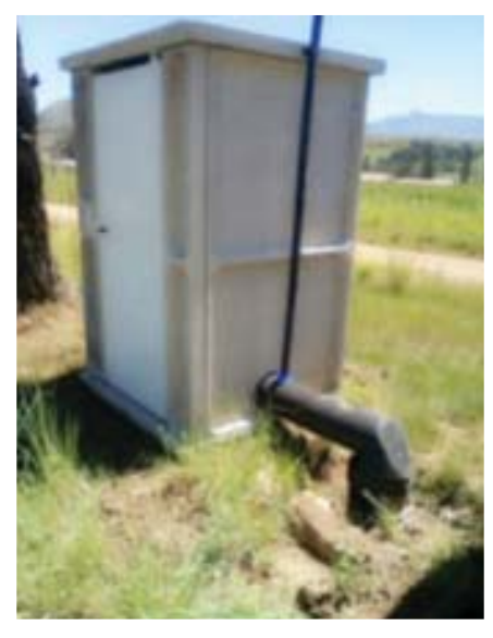
The superstructure with air vent.

The advantages offered by the earth auger is that we move away from the concept of a hole in the ground, towards sanitation which provides beneficiation. The bulking reduces smells and flies, and the products are not overly offensive and look like soil. The design and construction is much easier and can contribute to reduced capital costs and speed of installation. It is hoped that it can find application in a variety of settlement challenges in the future.