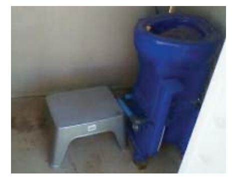
Positioning of the water dispenser, toilet sink and urinal

With the interest and support of the Chris Hani DM, 200 Earth Auger sanitation units have been installed to demonstrate the technology in the field. The site selected for the demonstration was at Ida Village, Indwe, in Chris Hani District Municipality (Eastern Cape).